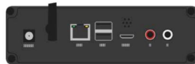
IN-STORE MUSIC PLAYER